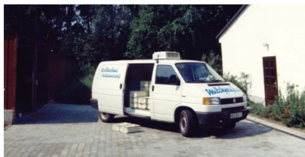
Sample transport service at the Control Institute

The samples to be analyzed are registered in the database of a Laboratory Information Management System. The working list is up-loaded from the LIMS by the operator and after the analysis is finished 1st line quality control is carried out before the data is transferred back to the LIMS. To run in conjunction with the Management System, Skalar also provides automatic quality control. The quality control samples are automatically analyzed against preset limits. The software, not only calculates the quality control samples, it also keeps track of the performance of the system itself.