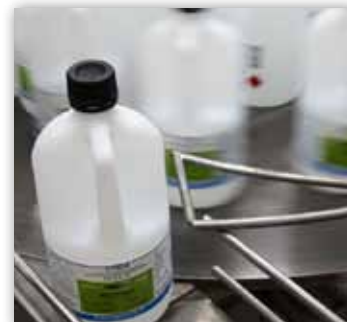
Ajax Solvents & Acids

ThermoFisher SCIENTIFIC The world leader in serving science