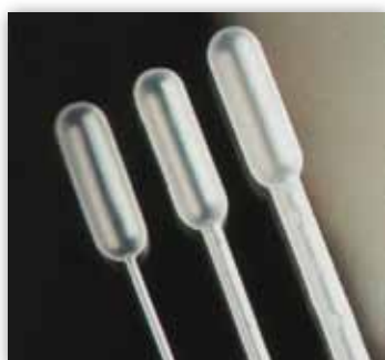
Samco Transfer Pipettes

Discover great pricing on quality products & brands