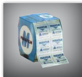
Parafilm Sealing Film