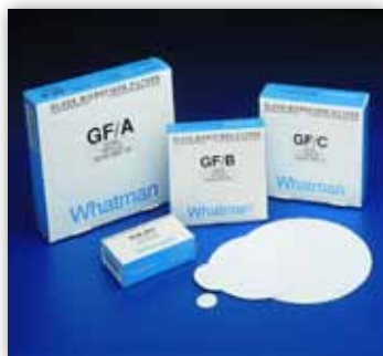
Whatman Filter Paper