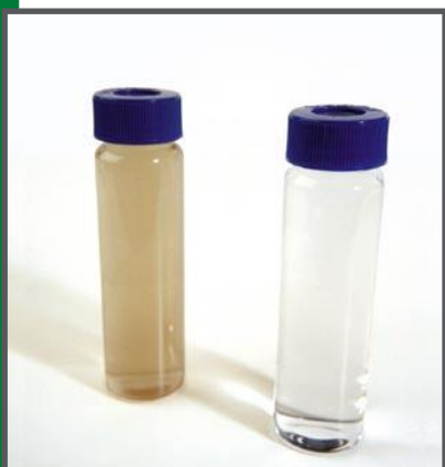
Low-Flow / MicroPurge sampling methods control turbidity and delivery higher quality samples.

Low-Flow samples represent a flow weighted average concentrations from typical monitoring wells and is the best approach for determining the true mobile contaminant load in most monitoring scenarios.